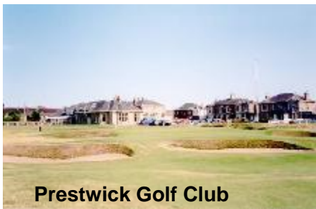
Prestwick Golf Club

Today after breakfast golf will be arranged at Prestwick Golf Club .