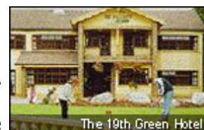
The 19th Green Hotel

Upon arrival in Shannon, you will be met by an SGH Golf representative who will present you with a travel packet complete with maps, local information, and places of interest. After being shown to your rental vehicle, you will drive south to the magical town of Killarney. Here you will check in to the 19th Green Guesthouse. The afternoon is free for you to relax and unpack.